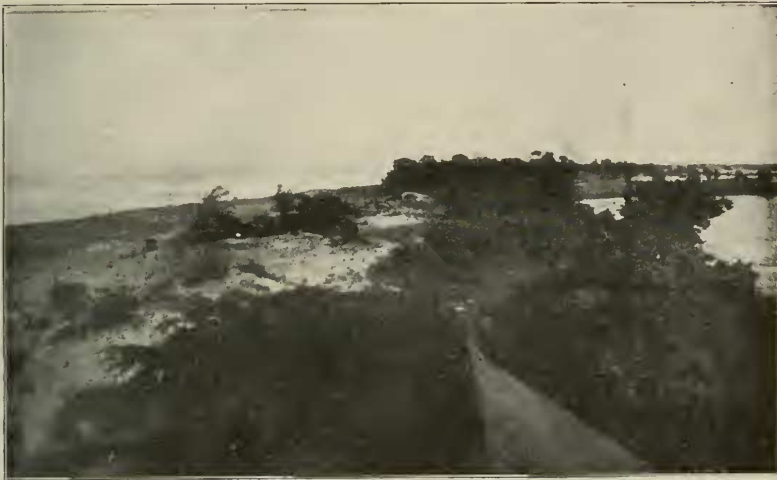
Fig. 2. The Dune Section, looking southwards from the Lake Laboratory. To the left are the dunes and the blowouts, the lake in the distance. Between the dunes and the bay on the right is the forest strip, here mainly consisting of the Ulmus-Acer and Ailanthus formations.

The median date of arrival at Oberlin is April 8, the earliest being May 28, 1904. At Cedar Point the median date of arrival is March 19, the earliest being March 16, 1907. They first reach Oberlin about October 1, and the last leave Cedar Point about November 4. At any time during the periods of migration one or two may be found